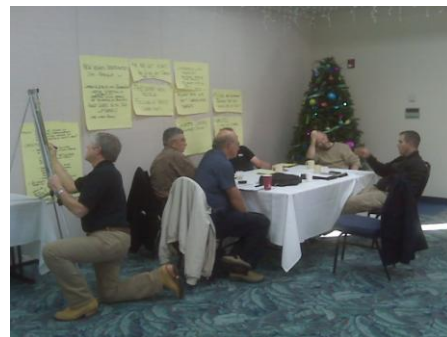
Your Board of Director at work discussion our issues.