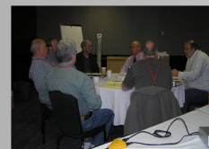
NWSA Training Committee at Work

The second phase is maintaining your certification. To do this you must have 8 hours of training per year, here are the two ways to do this: